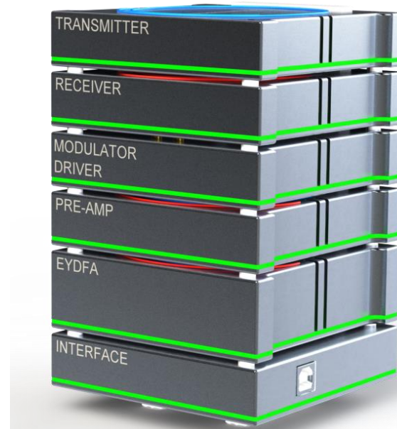
2U Cage System